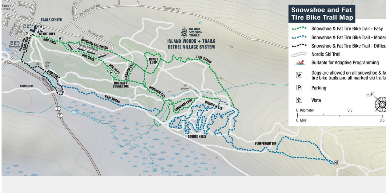
This map illustrates the trail network for snowshoeing and fat tire biking within the Inland Woods + Trails Bethel Village System. The trails are color-coded by difficulty: green for easy, blue for moderate, and black for difficult. The map also identifies parking locations, scenic vistas, and trails suitable for adaptive programming. Key trails include Dog Days, Bingham Extension, Donut Loop, Tree Stand, Raw Sugar, Bingham Ckt., Dog Days Connector, Bingham Loop, Double Helix, and Fluffernutter. The map is oriented with North at the top and includes a scale bar and a north arrow.